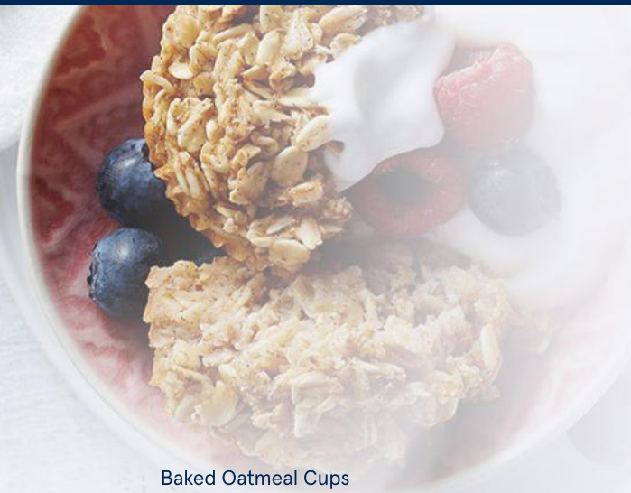
Baked Oatmeal Cups