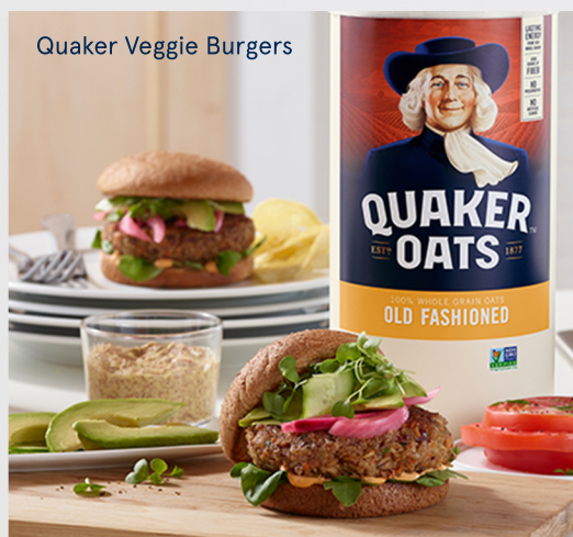
Quaker Veggie Burgers

Oats aren't just for your breakfast bowl – this versatile whole grain offers endless possibilities to get more nutrition and taste out of what we eat each day. Oats serve as a nutritious blank canvas – from savory to sweet, hot to cold, oats can provide goodness any time of day. Find inspiration to cook with this delicious super grain with these ideas, or try our recipes at www.QuakerOats.com .