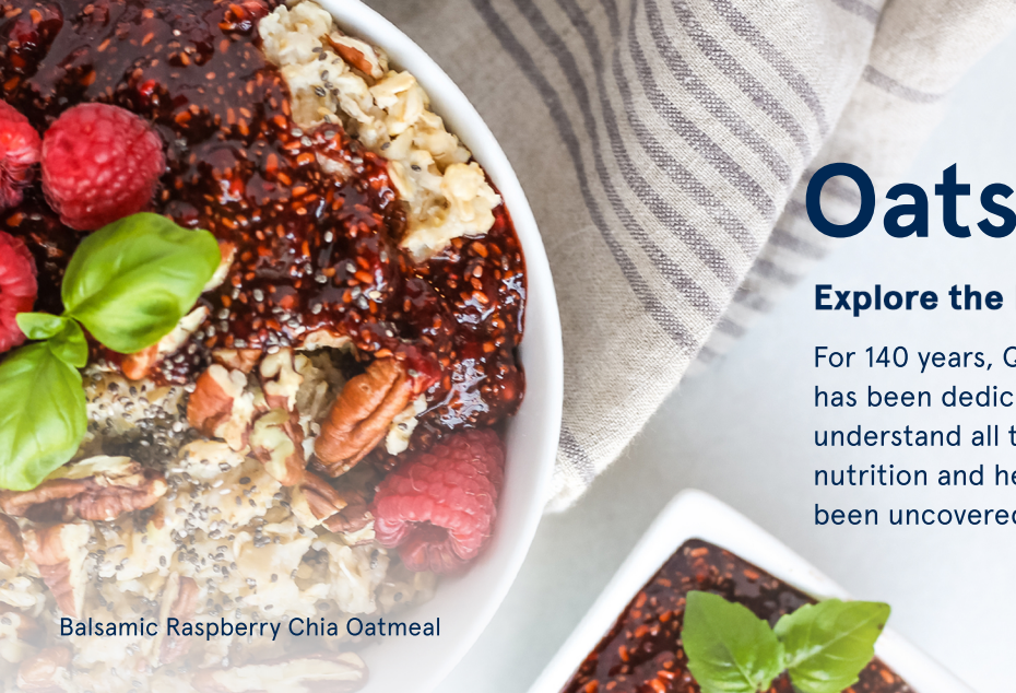
Balsamic Raspberry Chia Oatmeal